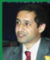
Miku Mehta Sughrue Mion, PLLC, Japan